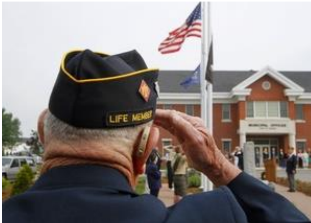
AMERICAN LEGION POST 202